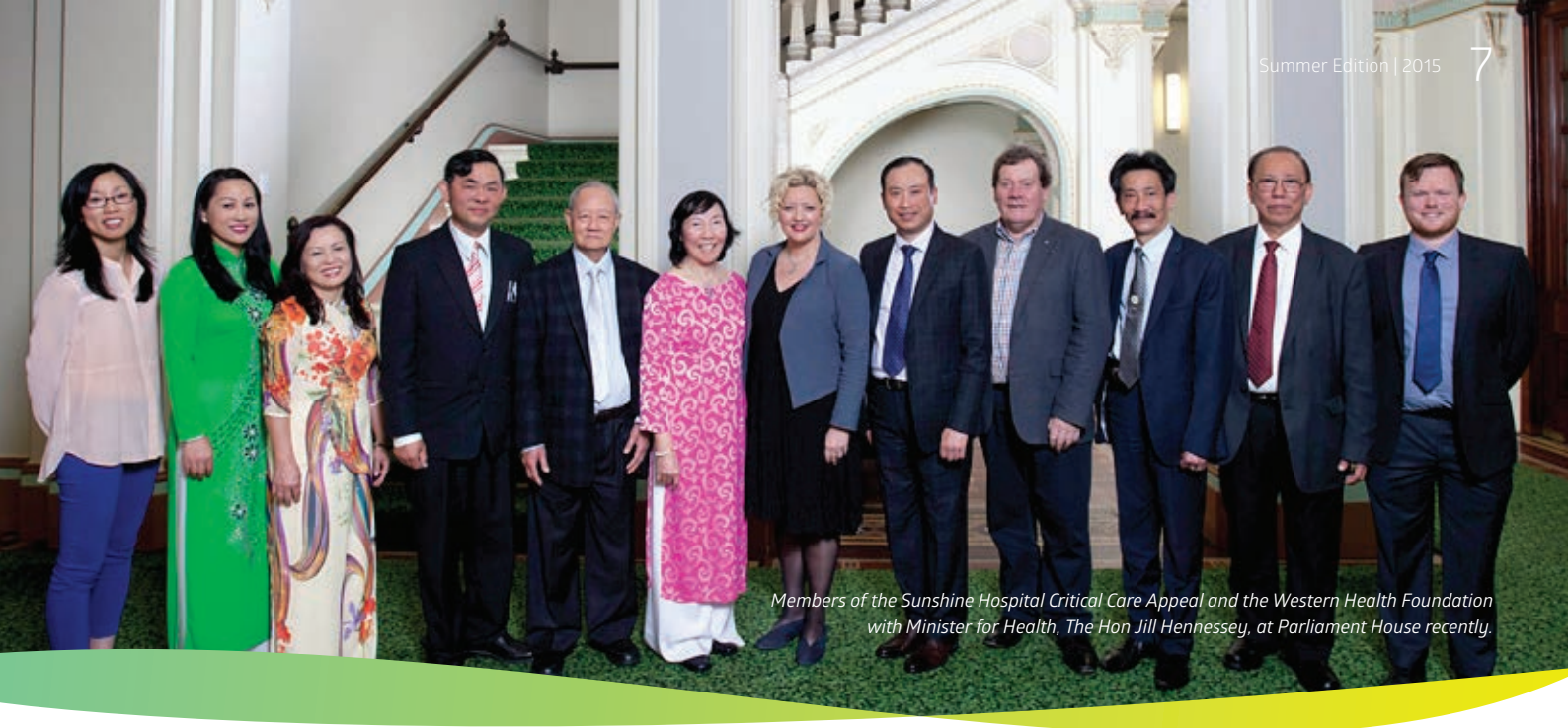
Members of the Sunshine Hospital Critical Care Appeal and the Western Health Foundation with Minister for Health, The Hon Jill Hennessey, at Parliament House recently.