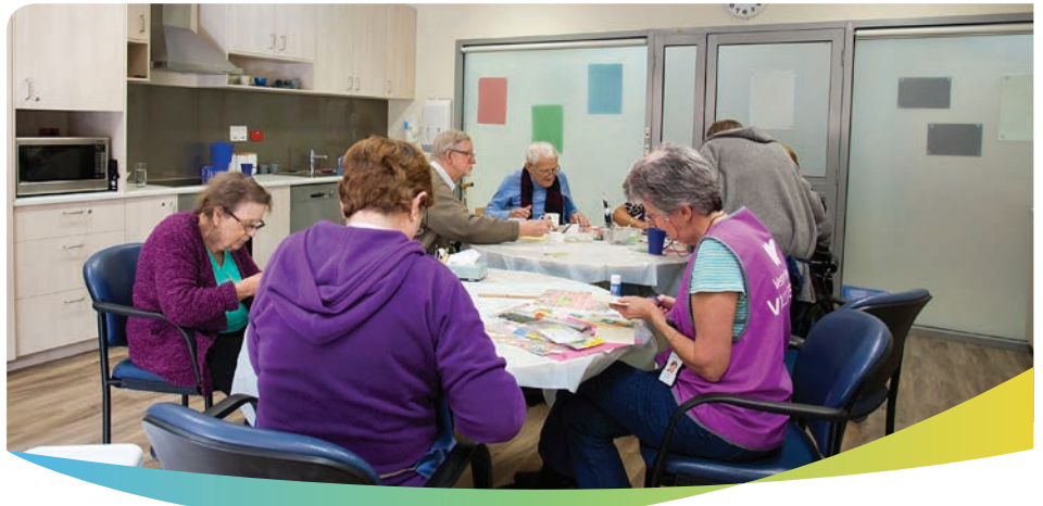
Clients, staff and volunteers enjoy the new surrounds in the refurbished Wellcare Program room.

The Wellcare Program remains a joint initiative between Western Health and Mercy Palliative Care.