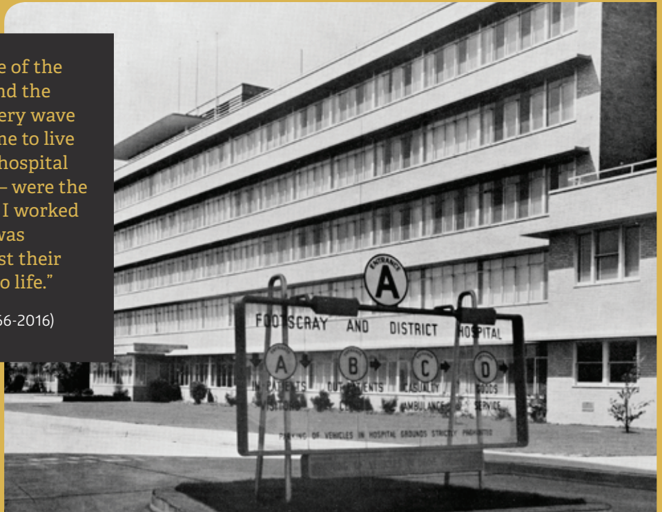
Footscray Hospital in the early days.