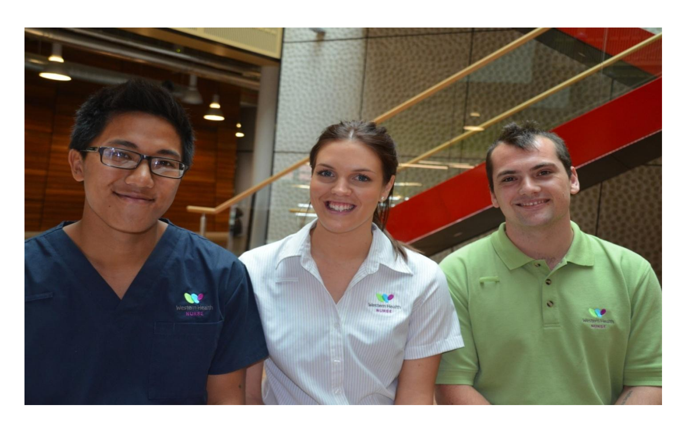
Clinical Experience at Western Health Williamstown Hospital Campus

Information for Students and Clinical Facilitators