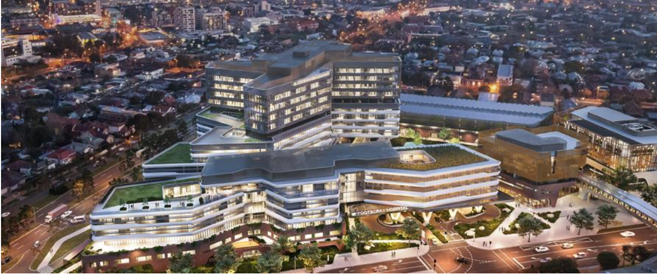
The Victorian government has provided up to $1.5 billion to deliver a new Footscray Hospital.

The new Footscray Hospital- the largest ever health infrastructure investment in the State - will have an increase of nearly 200 beds, and will treat approximately 15,000 additional patients and enable around 20,000 additional people to be seen by the emergency department each year. Construction is now underway, with the hospital expected to open in 2025.