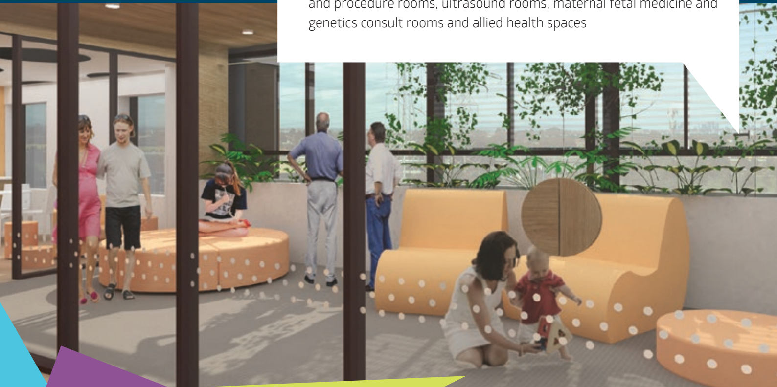
Family space filled with natural light and accessible from the women's and children's inpatient wards is a feature of the new hospital design.

+ Plus outpatient clinical spaces including interview rooms, treatment and procedure rooms, ultrasound rooms, maternal fetal medicine and genetics consult rooms and allied health spaces