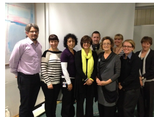
Consumer Information Review Group

Note: Your information will only be used for the purpose stated on this flyer.